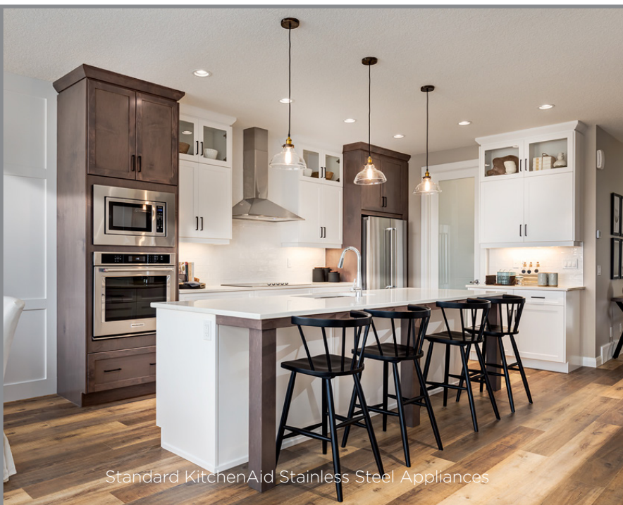
Standard KitchenAid Stainless Steel Appliances